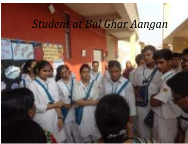
Student at Bal Ghar Aangan