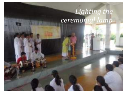
Lighting the ceremonial lamp