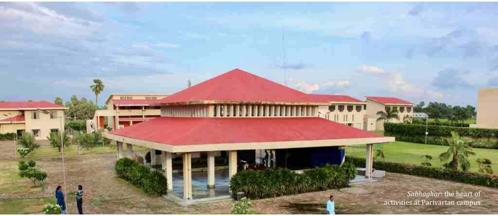
Sabhaghar: the heart of activities at Parivartan campus

Parivartan invites all parents for a day's visit at its campus from October 8-13, 2017 to experience the Rural Immersion Programme