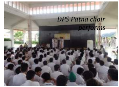
DPS Patna choir performs