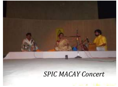
SPIC MACAY Concert