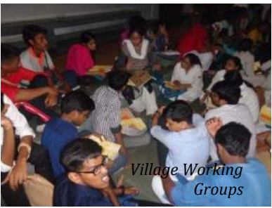
Village Working Groups