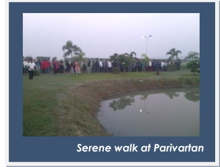
Serene walk at Parivartan

After the presentation finale and valedictory session, there was a delectable Chat party organised for the students, teachers, and staff members of Parivartan. After the treat, students were directed to collect their luggage and belongings from their living quarters and directed to board the bus. As is usually observed every year during the RIP, the students