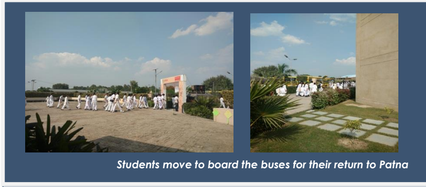
Students move to board the buses for their return to Patna